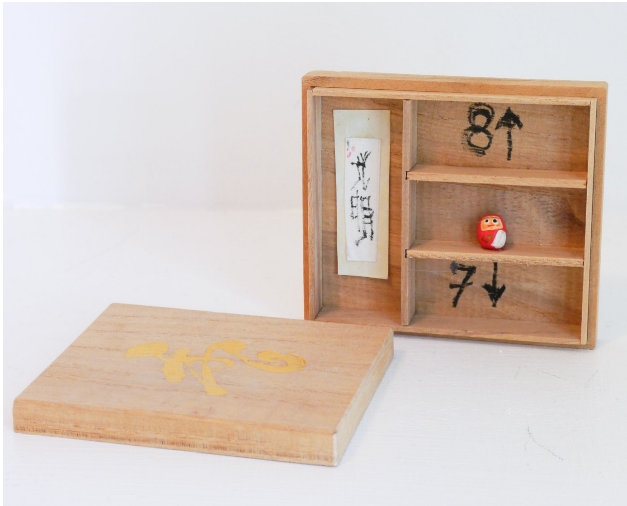
wooden box 4" by 3" by \frac{3}{4} " | Komyo scroll by Shikai sensei after Anzan Hoshin roshi | Daruma doll-wood- \frac{1}{4} "