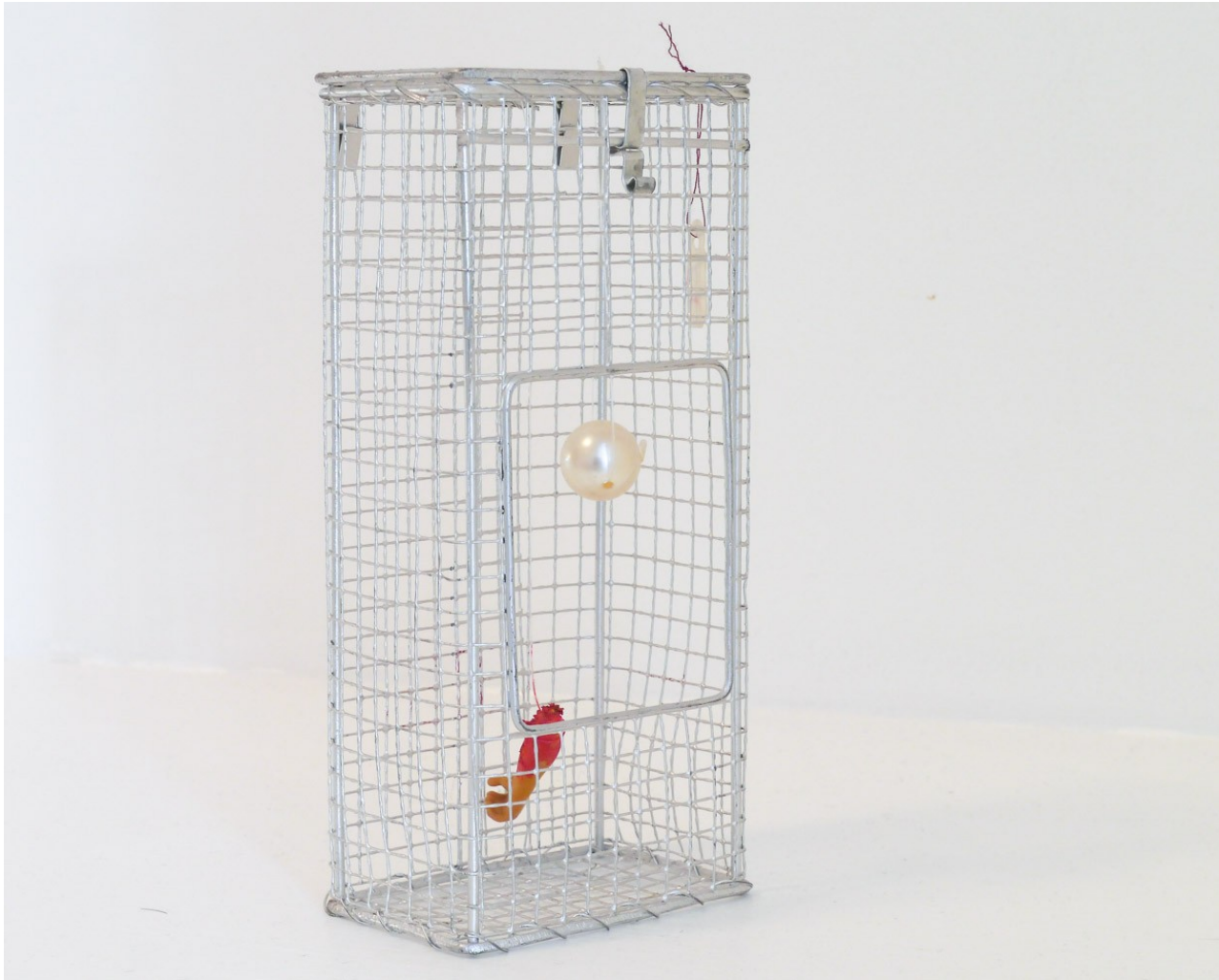
metal presentation case for a watch (6 ½" by 3" by 2") | artificial pearl | doll's arm with red acrylic paint | fishing line | paper tag