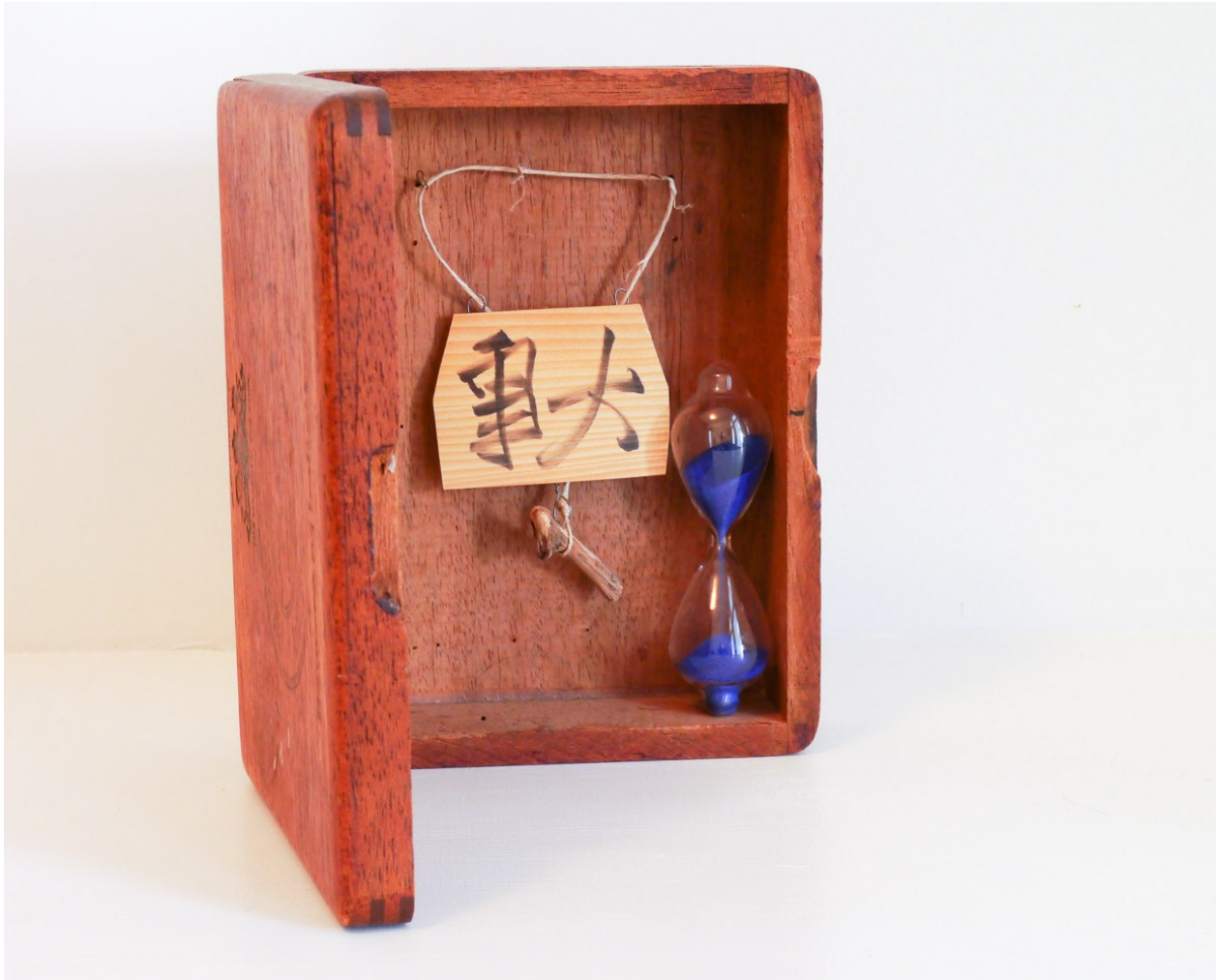
Benson & Hedges vintage wooden cigar box 7 \frac{3}{4} " by 6" by 2 \frac{1}{2} " | han brushed by Shikai Zuiko; "Great Matter" | branch striker | hemp twine | hour glass