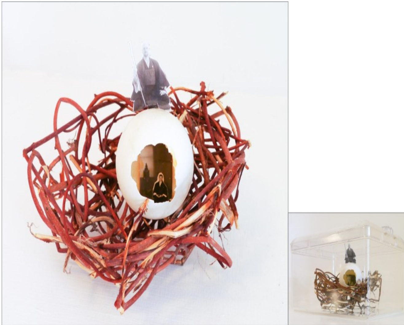
plastic box 8" by 5 ½" by 4" | nest of woven twigs 5" by 5" | photos by Shikai osho of: Anzan sensei (at the time), self, Butsudan at DaijozaN | commemorates receiving of first monk's vows