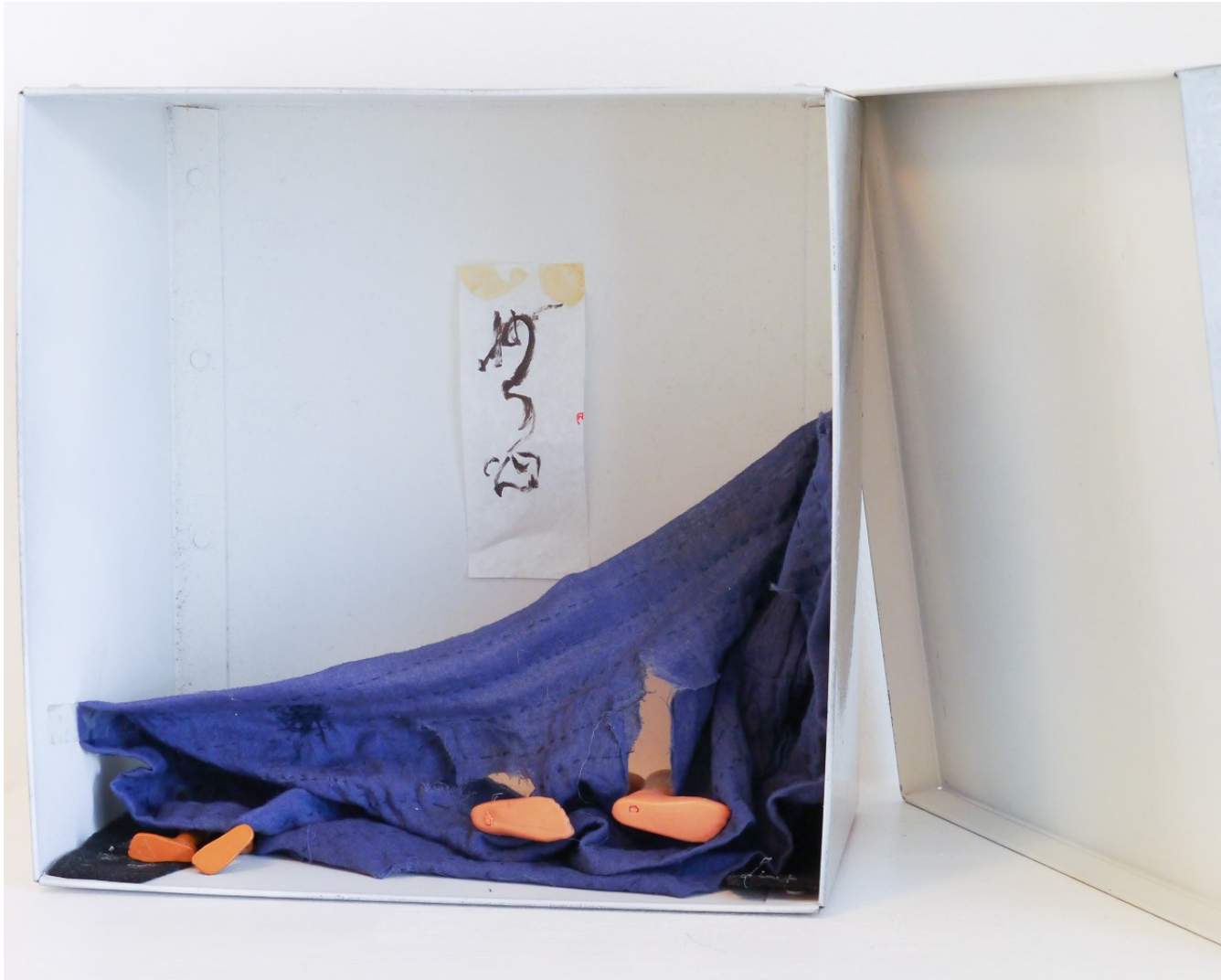
metal box from Ikea-9" by 9" by 5 3/4" | blue curtain fabric | severed dolls' legs | paper scroll-Sho brushed by Shikai sensei after a sho by Anzan Hoshin roshi