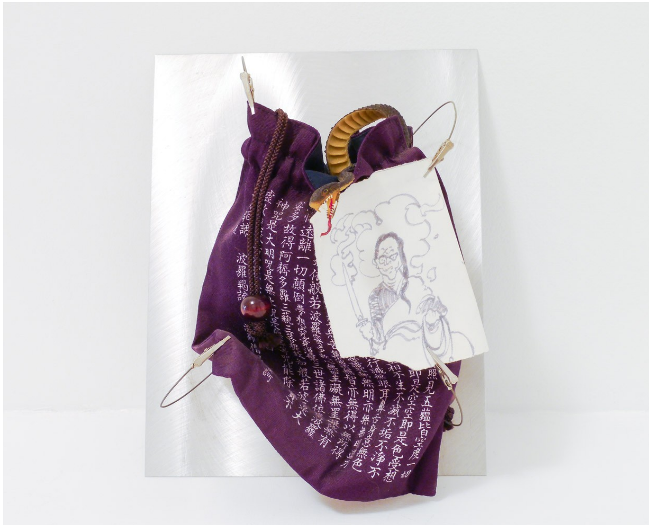
"Mahaprajnaparamita Hridaya Sutra" on silk bag | Shikai osho as Acala Vidyaraja-zenga by Anzan Hoshin roshi | rubber snake | metal photo holder received as gift