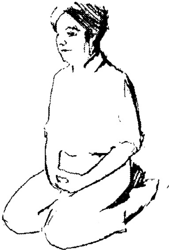
Seiza with zafu