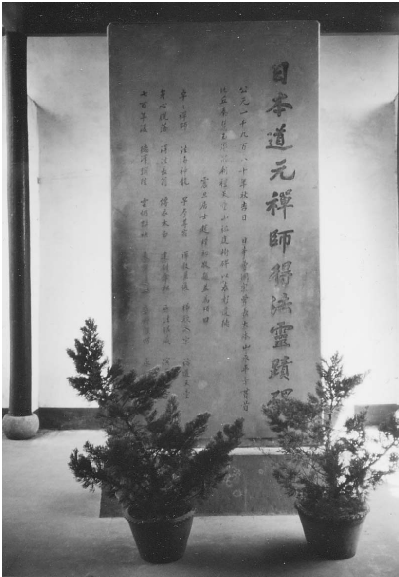
Eihei Dogen's stele, dedicated to Eihei Dogen zenji Tiantong-si, China Shikai Zuiko 1991