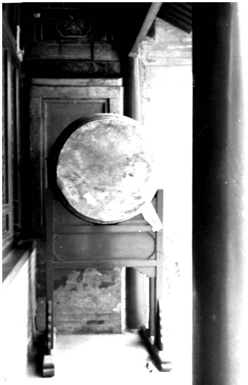
Daoist Temple, Beijing Shikai Zuiko 1991