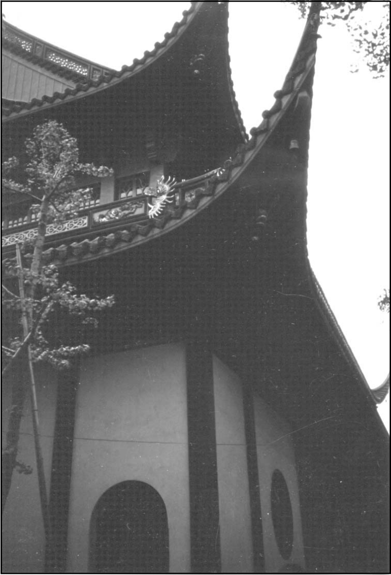
Aiwan shu, Ningbo, China Shikai Zuiko 1991